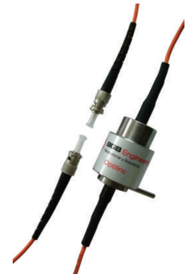
Without Flange Mount

The Optilinc system has been thoroughly developed in BGB's R&D Lab and is now being implemented in the design stage of leading wind turbine manufacturers.