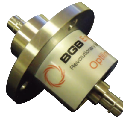
With Flange Mount

The new BGB Optilinc system has been produced to revolutionise the slip ring market. Optilinc is the first of the new generation of contactless slip rings to be produced by BGB Engineering Ltd. The fibre optic rotary joint (FORJ) is ideal for high speed data-transfer on many applications.