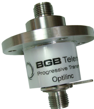
Optilinc with RSC Connector & Flange

The FORJ has been rigorously tested by Deutsch UK Ltd to EN2591-601, (Aerospace series - Elements of electrical and optical connection Part 601: Optical elements - Insertion loss) and to EIA standards.