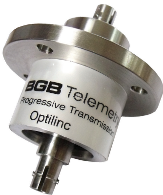
Optilinc with ST Connector & Flange